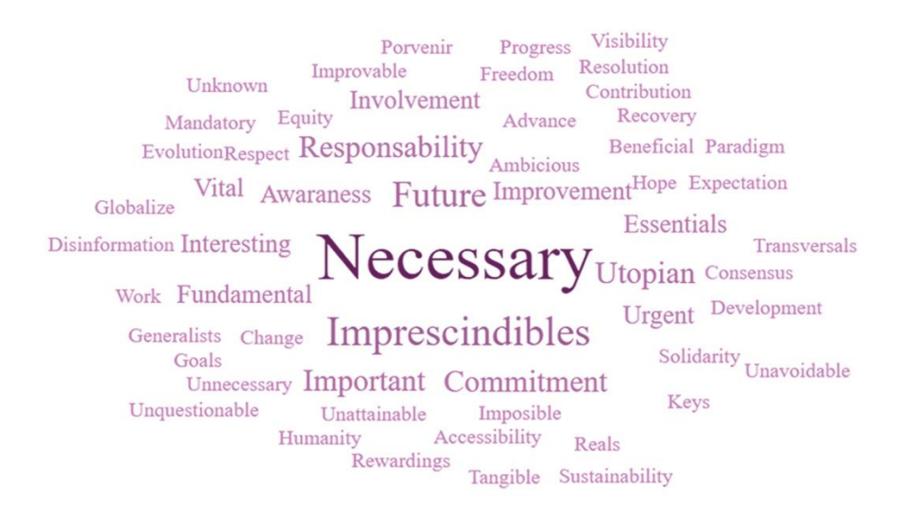
Figure 3. Word cloud about "Perception of the SDGs".

The qualitative data obtained in the two open-ended questions were analyzed by conducting a textual analysis. First, they were asked about a word that represented their opinion about SDGs. The information obtained allows us to establish a ranking of 10 elements among which the following words stand out in the first five positions: "Necessary" (15.68%), "Indispensable" (7.8%), "Future" (5.8%), "Responsibility" (4.5%) and "Commitment" (3.9%) as the most frequent among the 153 respondents. In addition, a classification is made with "Others" that have a frequency equal to or lower than 1.9%, among which we find: "Important", "Awareness", "Essential" and "Utopian". Figure 3 shows a word cloud with the concepts expressed by the students.