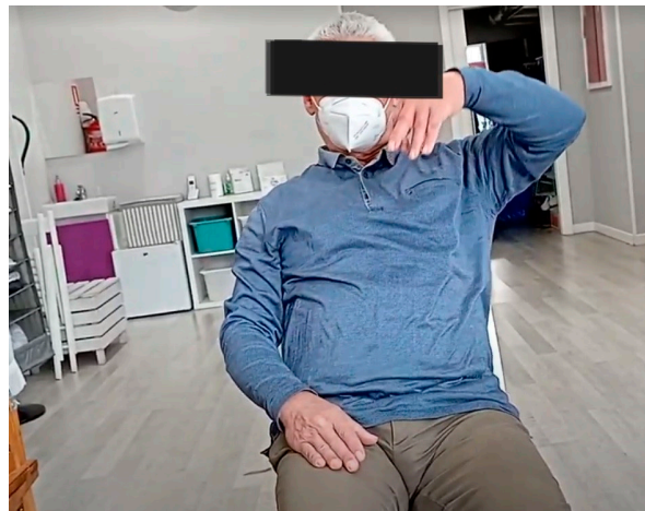
Figure 1. Participant performing the FMA-UE assessment.

Second, the posturographic test was performed. The posturographic analysis of static balance was performed using the Modified Clinical Test of Sensory Interaction on Balance (mCTSIB) of the posturography program, which has been validated for people who have had a stroke using the Wii Balance Board ® (WBB) as a force platform [29]. The Posturography software is accessible and free of charge and can be used on any computer. Bluetooth is required to connect the computer with the WBB. Its features make it easy to transport and facilitate the participation of different centers.