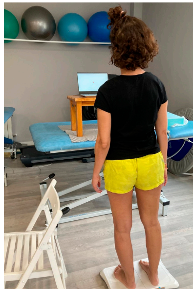
Figure 3. Participant performing mCTSIB test.