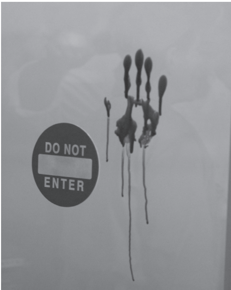
From The Mist (dir. Frank Darabont, 2007).

In the case of War of the Worlds , this institutional and social reflection is marked by pessimism and thus warns of citizens' hysteria during the extraterrestrial attacks. Although occasions of heroism or solidarity are underlined, panic is the tone of the plot, and certain scenes reveal a Hobbesian view of society, whose members are capable of murdering others in their desire to survive. The question of panic as a threat against a society under attack is one of the warnings of Wells's novel. Spielberg merges two original characters, an artilleryman and a vicar destabilized by the horror, into the character of Ogilvy the sniper. Ray and his daughter take shelter in a basement where Ogilvy, entrenched, fires on the extraterrestrials and proclaims fanatically that, as the story demonstrates, America cannot be invaded. Ogilvy, victim of paranoia and fanaticism, ends up posing a mortal danger to the father and daughter, imprisoned in the same mousehole as he is. Ray ends up killing him.