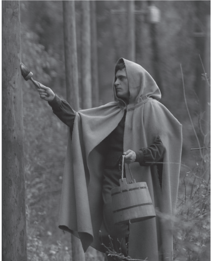
From The Village (dir. M. Night Shyamalan, 2004).

M. Night Shyamalan deals with this theme of social self-defense in The Village (2004), a thriller about a small, isolated community in a hamlet completely disconnected from the outside world and surrounded by a wood inhabited by ferocious creatures of superhuman nature: “Those We Do Not Speak Of.” The governing council of elders main-