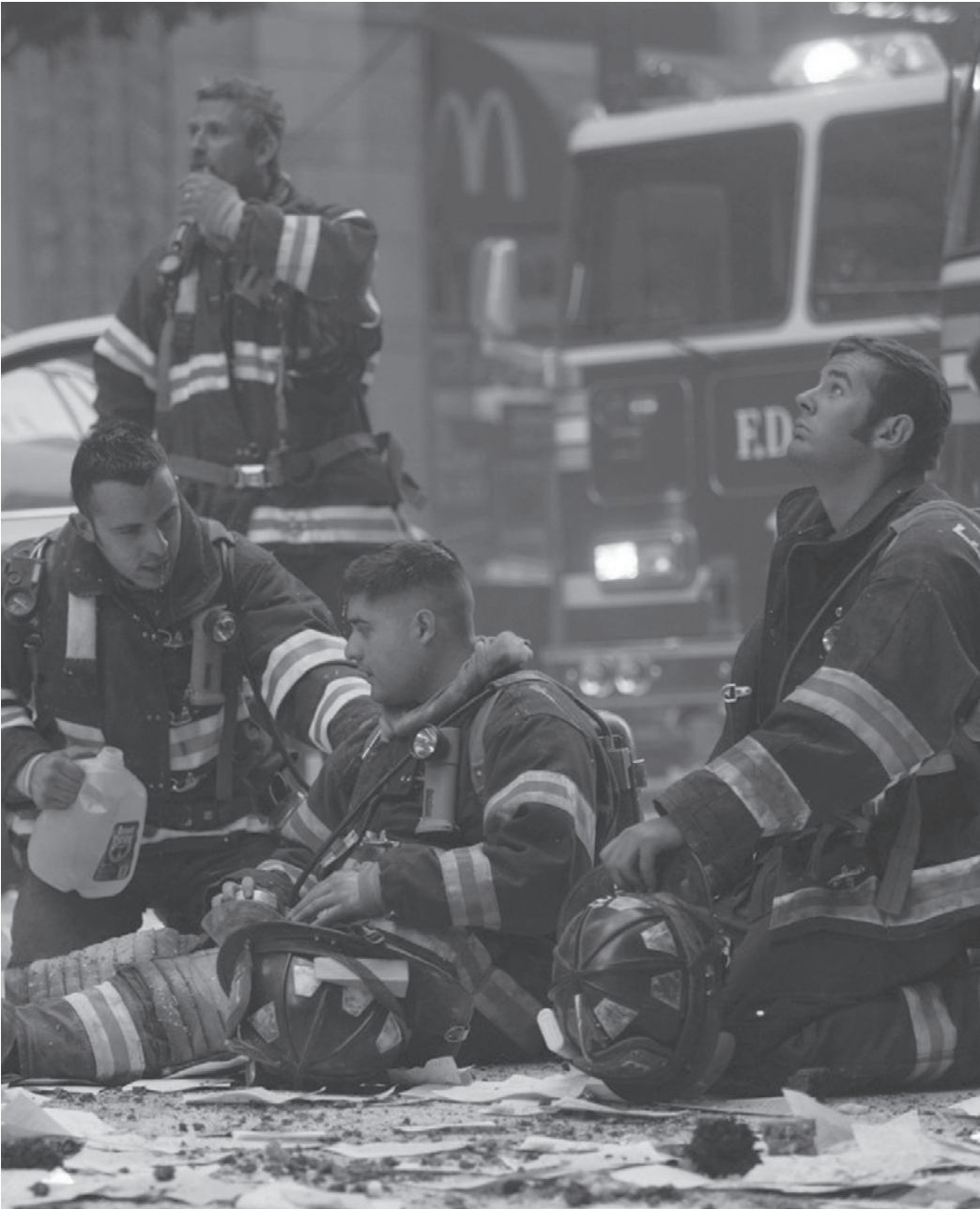
From World Trade Center (dir. Oliver Stone, 2006).

thetical discourse can be summed up in five proposals for reflection: the controversy between national security and civil liberties; the risk of xenophobia and entrenchment in North American society; the self-destructive effect derived from a situation of permanent panic in the face of external threats; the implications of a preventative war on both a national and international level and in the familiar and social levels, and finally, the human and social cost of the spiral of violence-vengeance.