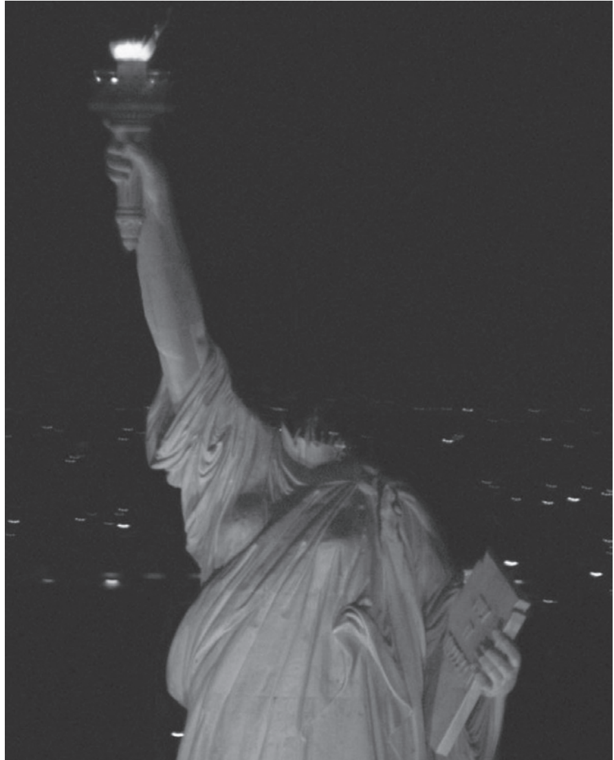
From Cloverfield (dir. Matt Reeves, 2008).

The recourse to suicide, the second sign of social self-destruction, is set out in the ending of the script. After the murder of the visionary in self-defense, an end identical to that of Ogilvy, the protagonist flees in an automobile with a painter who is travelling with his